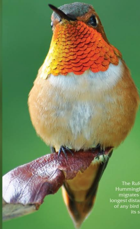
The Rufous Hummingbird migrates the longest distance of any bird per its size.