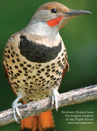
Northern Flickers have the longest tongues of any Puget Sound area woodpecker.